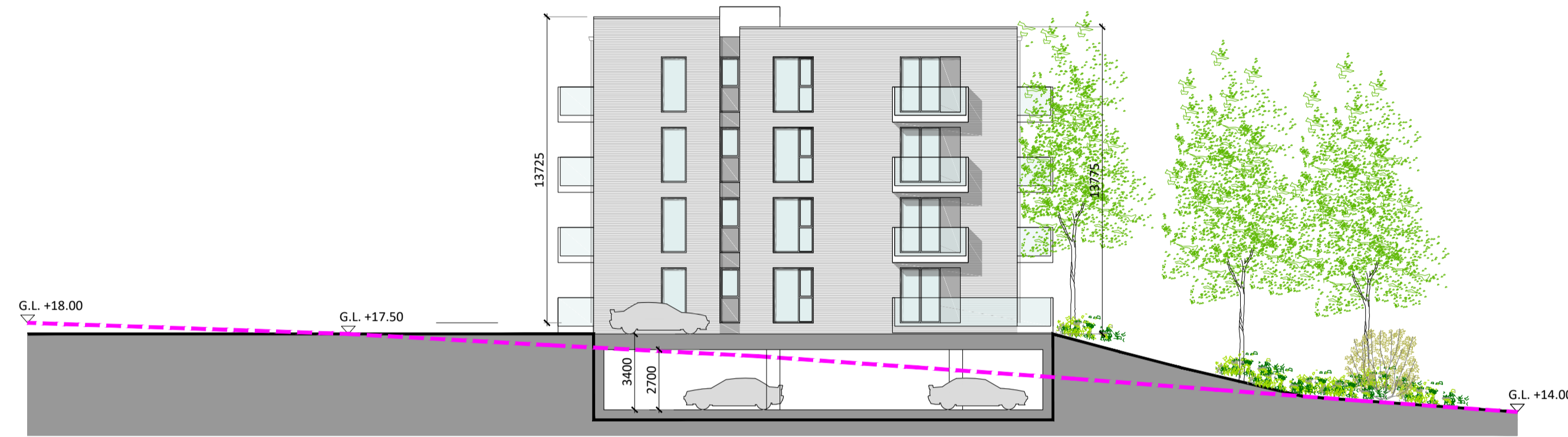
Section C-C (Through Surface Parking) scale 1:200