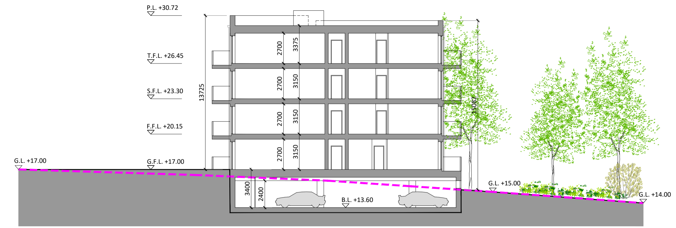
Section D-D (Block A) scale 1:200